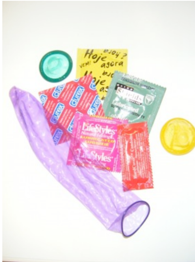
Demonstration of Male Condom